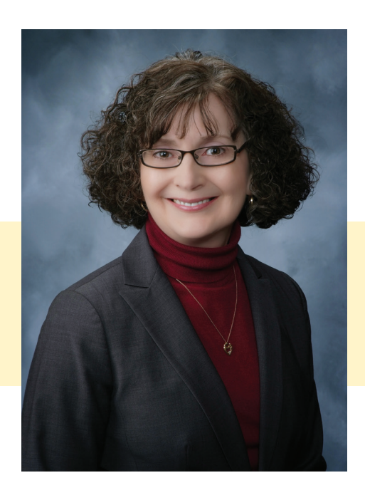
Dear Colleagues and Friends:

It is my pleasure to present Cameron University's Campus Master Plan 2025 Executive Summary, a document that provides an overview of Campus Master Plan 2025. Campus Master Plan 2025 is Cameron's guiding architectural document for the next 13 years—its blueprint for university growth and development. The Executive Summary is a brief of the Campus Master Plan, condensed and compact for quick review.